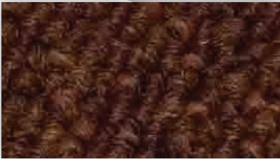
▲ SL: M55.311