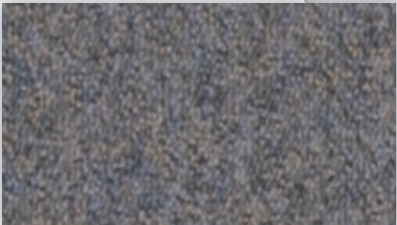
▲ SL: M55.840