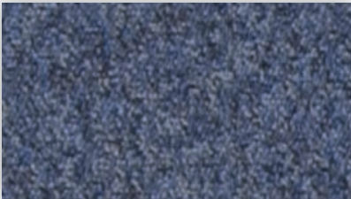
▲ SL: M55.780