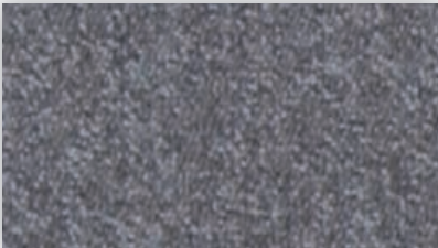
▲ SL: M55.830