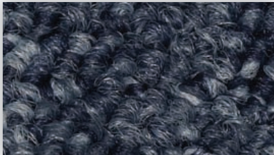
▲ SL: M55.781