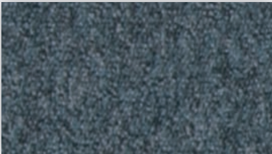
▲ SL: M55.680