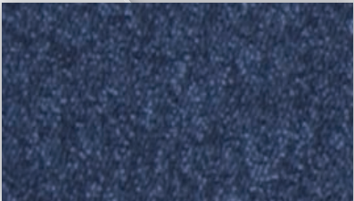
▲ SL: M55.790