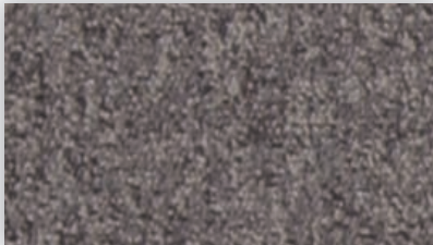
▲ SL: M55.270