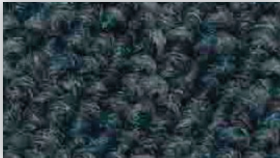
▲ SL: M55.731