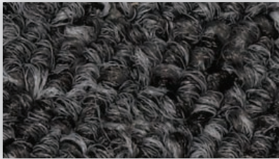
▲ SL: M55.831