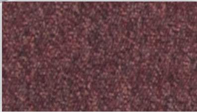
▲ SL: M55.120