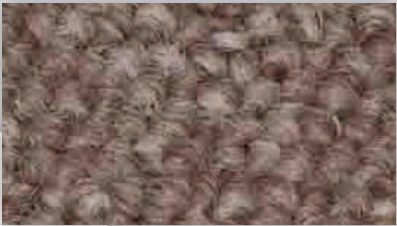
▲ SL: M55.221