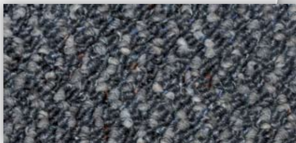
▲ IB: SEI.840 | 400 cm