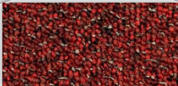
▲ IB: SEI.111 | 400 cm