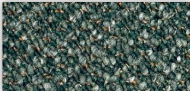
▲ IB: SEI.681 | 400 cm