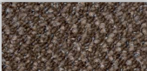
▲ IB: SEI.220 | 400 cm