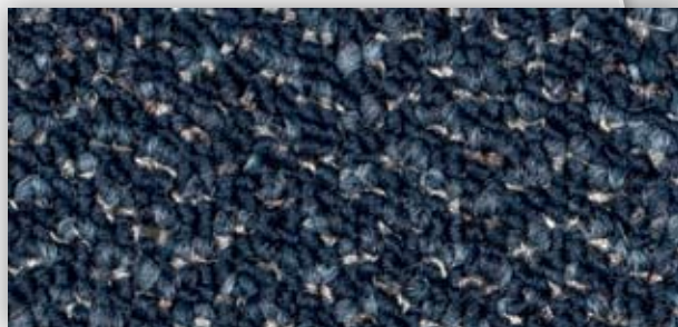
▲ IB: SEI.791 | 400 cm