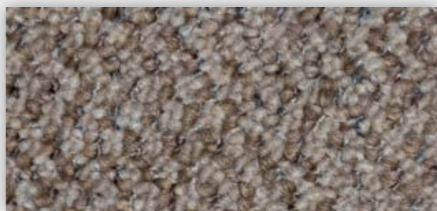
▲ IB: SEI.230 | 400 cm