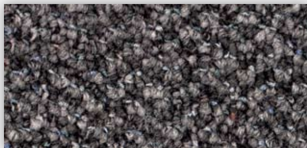
▲ IB: SEI.831 | 400 cm