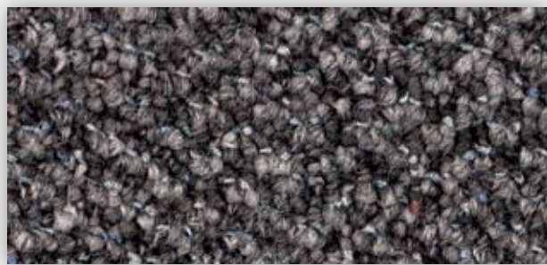
▲ IB: SEI.831 | 400 cm