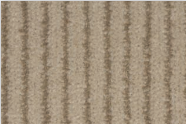
▲ SB/FS: SU1.241