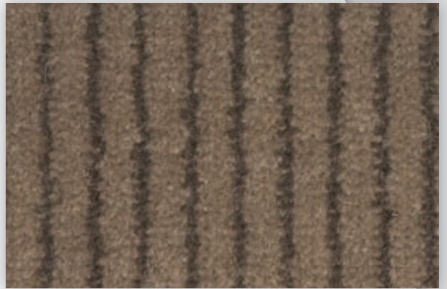
▲ SB/FS: SU1.261