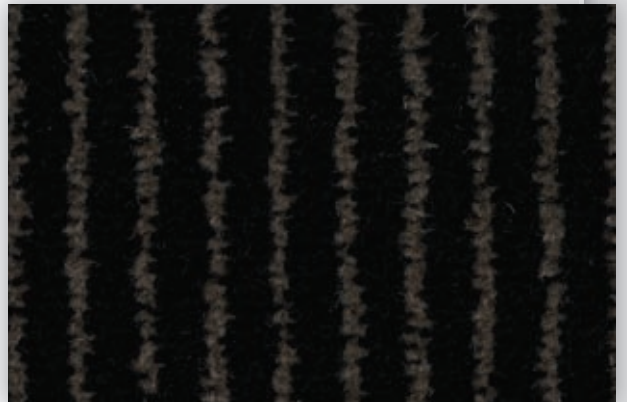
▲ SB/FS: SU1.801