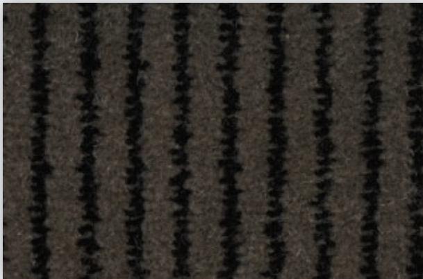
▲ SB/FS: SU1.271