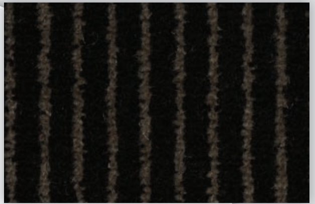
▲ SB/FS: SU1.211